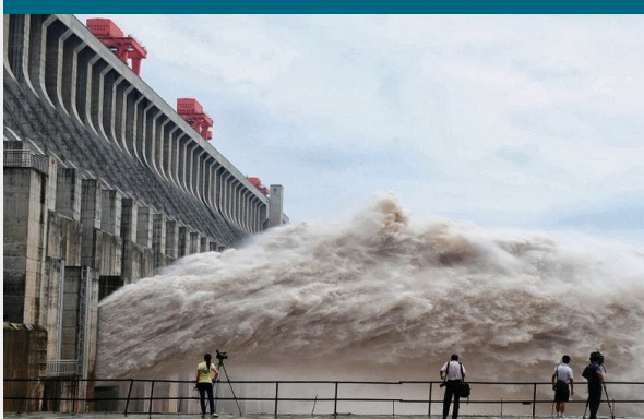
Click Picture for Larger View

DAM THIS — The Three Gorges Dam that spans the Yangtze River, China, is the world's largest power station in terms of installed capacity. The dam is 2,335 meters long and 181 meters tall. Made of 27.2 million cubic meters of concrete and 463,000 tons of steel, it is enough to build 63 Eiffel Towers.