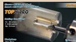
TopMicro Demo Video